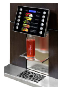
edition FIX L