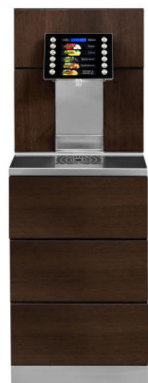
JDM ID M with design ZORRO