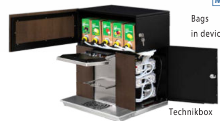
Bags in device