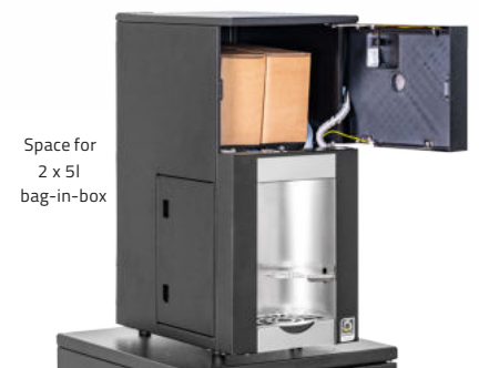
Space for 2 x 5l bag-in-box