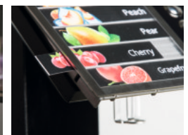
ESI (Easy slide in) labels