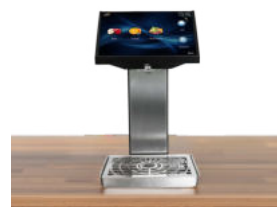
Standard delivery content